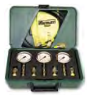
Plastic Case Test Kit - 63mm Gauge