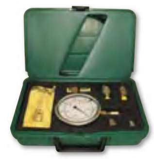
Plastic Case Test Kit -100mm Gauge

Plastic gauge boxes are available with 1, 2 & 3 63mm gauges and 1 gauge in 100mm, in a standard plastic box which carries test points and hoses in the base. The test boxes use the SPG series of gauges and therefore the pressure ranges need to be selected from page 3. Stauff Test 20 or Test 12 can be selected as the means connection.