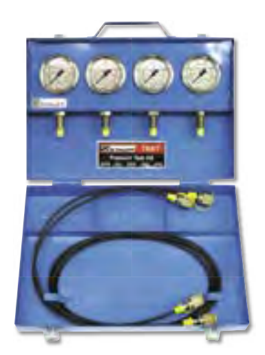
Test Hose included in Kit

Metal gauge boxes are available with 2, 3, 4, 5 & 6 gauges in a standard metal box which carries test hoses in the base. Compartments available to store Test couplings and adaptors sold separately. The top can be slipped off the hinges for hanging close to the test point by the top mounted handle. The test boxes use the SPG series of gauges and therefore the pressure ranges need to be selected from page 3. Either Stauff Test 20 or Stauff Test 12 can be selected as the means connection.